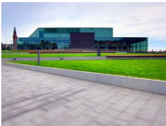
Helsinki Music Hall

Participation in the social program is not included in the registration fee. Price 600 SEK. To be booked in advance on the registration form