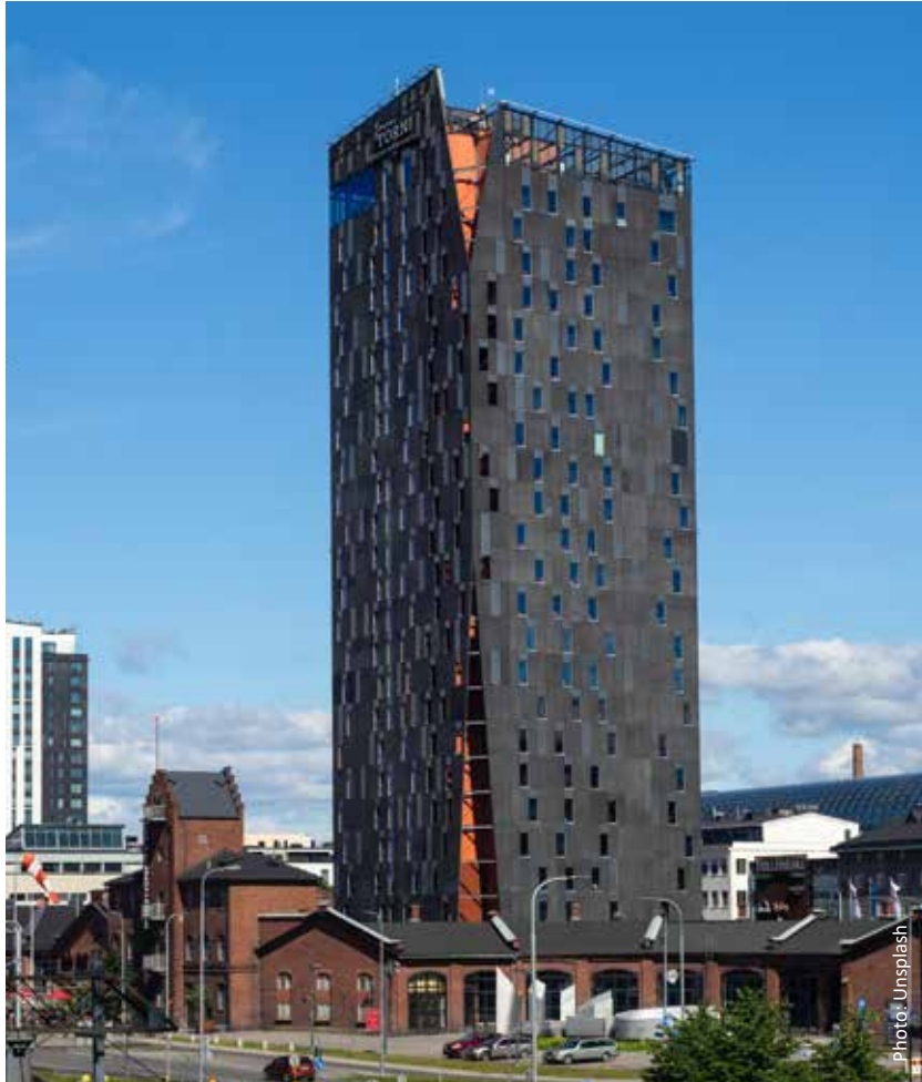
Solo Sokos Hotel Tornio Tampere