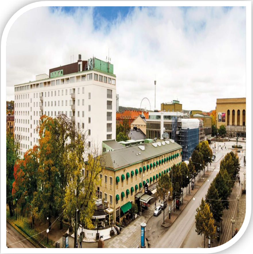
Elite Park Avenue Hotel, Gothenburg