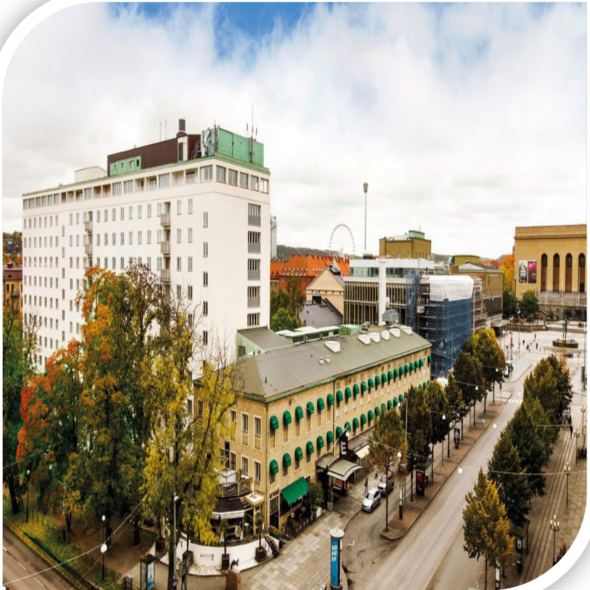
Elite Park Avenue Hotel, Gothenburg